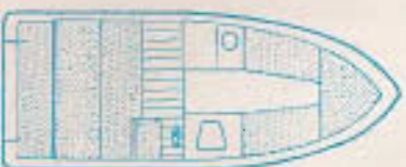
503GT SHOWING COCKPIT BUNK/ SUN LOUNGER